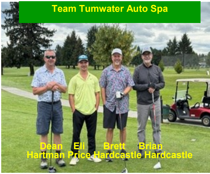
Team Tumwater Auto Spa